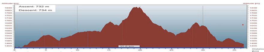
DIRTY HARRY 38 km MTB ROUTE PROFILE